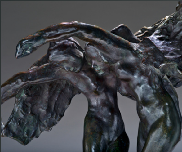
Les Bénédictions (The Benedictions), or les Gloires (The Glories) before 1896

Nearly fifty works will be exhibited to passengers in Hall M of Paris-Charles de Gaulle airport.