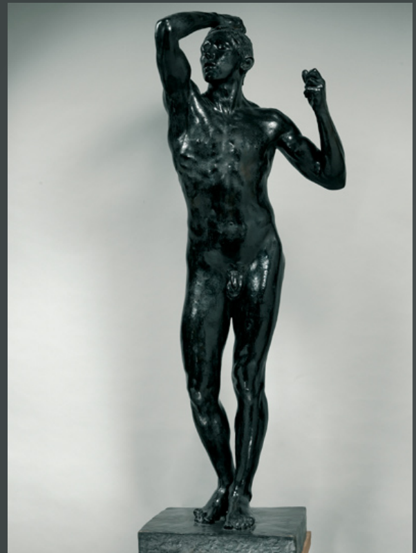
L'Age d'airain (The Age of Bronze) 1877

This work is symbolic of the title of the exhibition organised by Musée Rodin within Espace Musées at Paris-Charles de Gaulle airport: Les Ailes de la Gloire (The Wings of Glory).