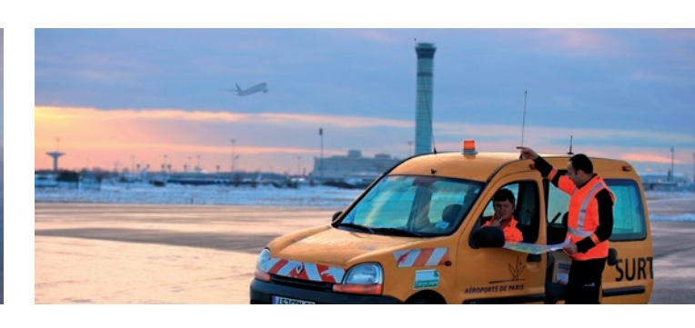
Snow is a fact of winter...